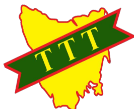
Table Tennis Tasmania Inc.

Refreshments and food will be available from the Kingborough Sports Centre's Borough Bean Café located adjacent to the main reception desk.